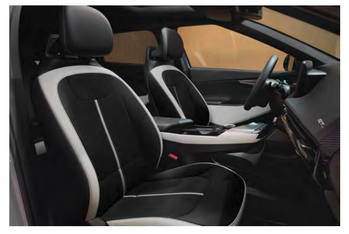
GT-line - Black Suede & White Vegan Leather