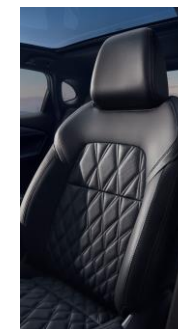
Nappa Quilted Leather Seats