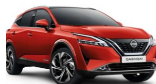
FUJI SUNSET RED